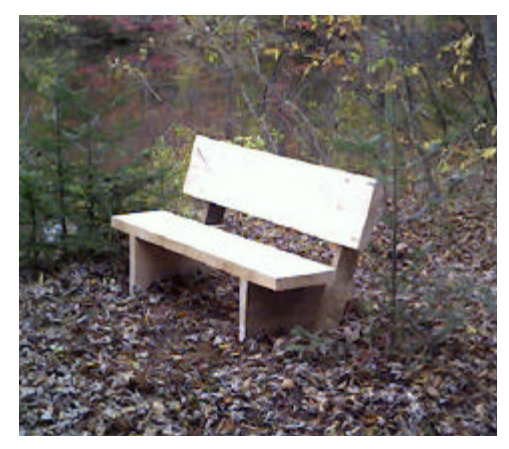
One of the two new benches

building permit was required for the bridge. It wasn't. He did, however, need to obtain a permit from the supportive Limington selectmen to haul debris -- four truckloads eventually --- to the dump. Local businesses responded as well, donating lumber, nails, orange spray paint, and sheet metal (for the blaze templates).